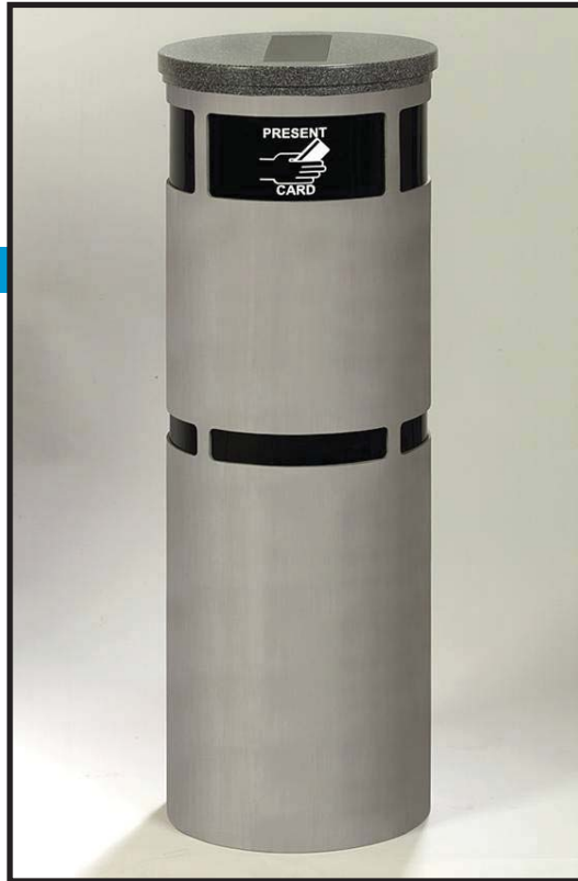
Canister Style Optical Turnstile