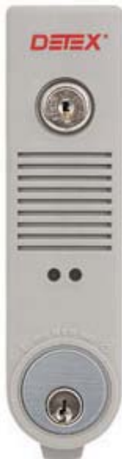
Shown with mortise cylinder (cylinder sold separately - add xMC65 to order the ES500 with mortise cylinder)

ES411W ES4200 ES4300A ES440 ES450 ES4600 ES500