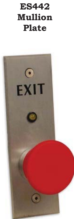
ES442 Mullion Plate