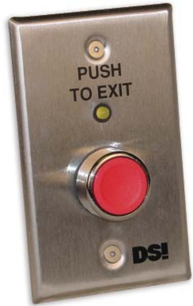
ES441 with Stainless Steel Plate

The ES440 Series of push button control units consist of button controlled devices for use in access control systems. Momentary, latching, and time delay relay (TDR) are available.