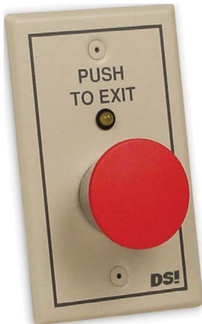
ES440 Painted Aluminum Plate