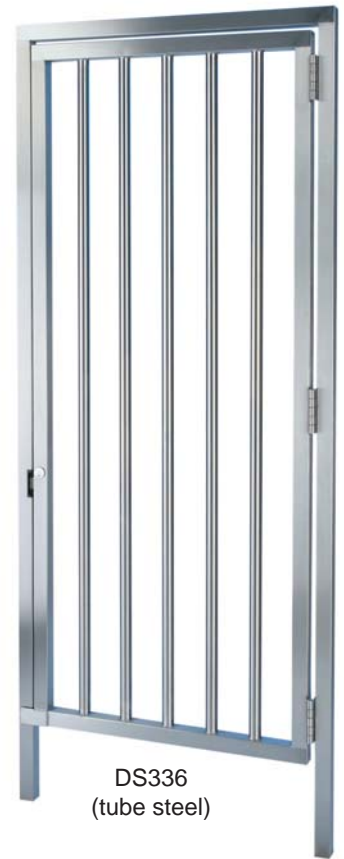
DS336 (tube steel)